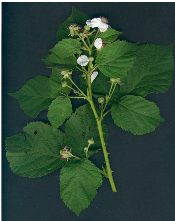
Figure 1. R. vikensis from Onsala (top) and Trönninge (bottom).